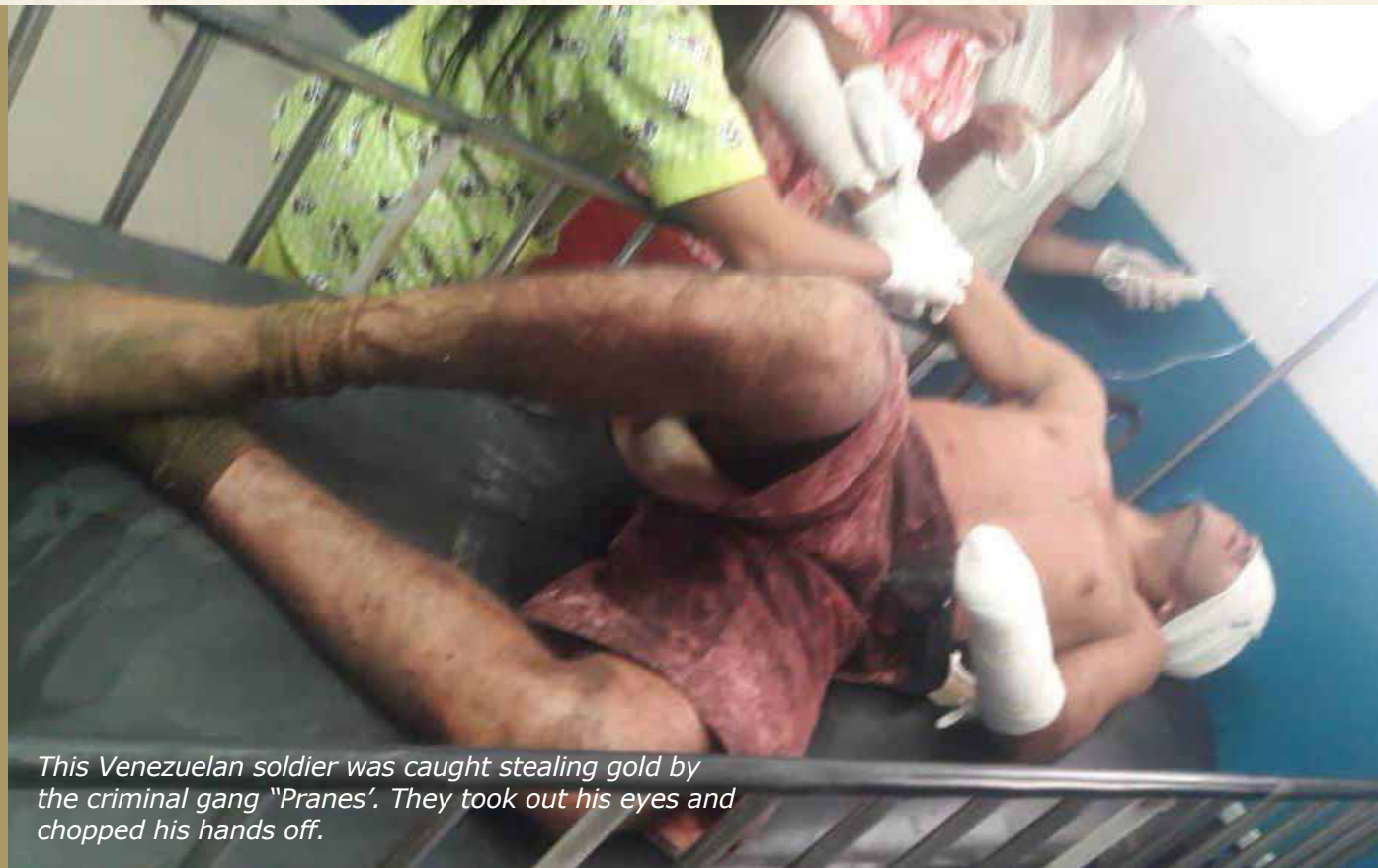
This Venezuelan soldier was caught stealing gold by the criminal gang "Pranes". They took out his eyes and chopped his hands off.

Venezuelan gold business brings with it chaos, crime, kidnapping, murder, well-armed gang members, and guerrillas, but it's booming because of the vast amount of money that is being made by those involved. The profits from the Venezuelan gold business go to sustain the affluent lifestyles of those in the upper echelons but also to corrupt officials and influential people in the region and internationally