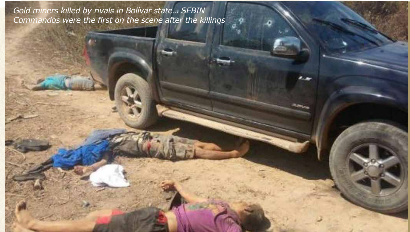
Gold miners killed by rivals in Bolívar state... SEBIN Commandos were the first on the scene after the killings

• Venezuelan gang members: Gang members from groups such as Pranes are into almost every dirty way of making money; including extortion, killing, kidnapping, drug trafficking, and human trafficking. And now they are into the gold business with the blessing from high-up officials from