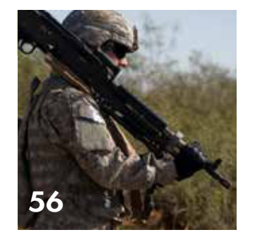
Cover Photo: Photo by: Nicholas Upton